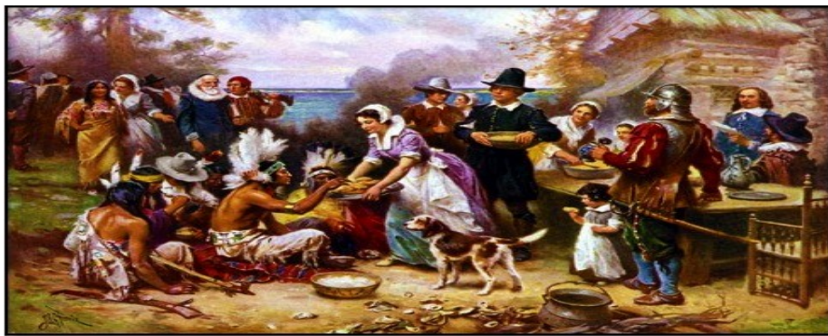
The First Thanksgiving

If you are a Veteran,, please call 941-493-8762 & leave your name & branch of service