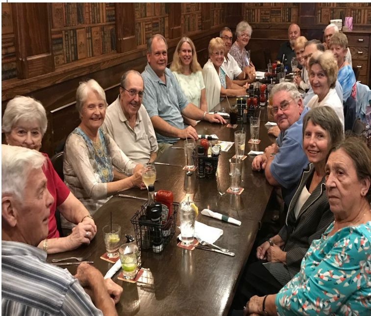
18 residents enjoyed conversation & good food at British Pub